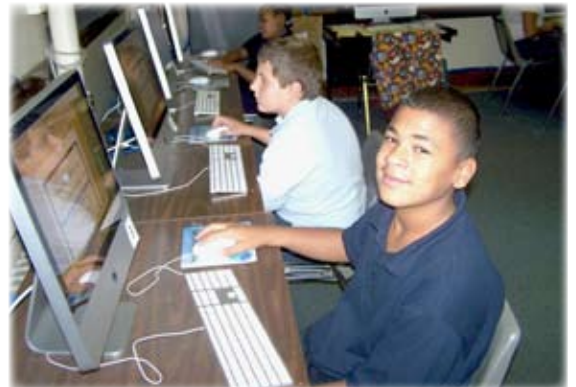
Engaged and happy in the computer lab

All students K-8 enjoy a weekly class in the computer lab with a special computer teacher. Students learn elements of keyboarding in every grade, and complete many special projects. The labs are also available to individual students, teachers, and classes for special classwork. After school hours, the Stephen Building Lab is used for Spanish Classes, where the Rosetta Stone software provides a structure for learning the Spanish language; for robotics classes; for remedial reading; and by individual students working on assignments. In a changing world, one thing we are sure of is the importance of technology in our children’s futures. Today’s children will use technology in any profession they choose. We want to make sure they are ready!