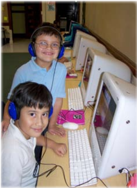
Yes, we are “naturals”